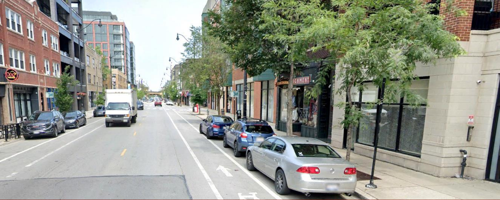
2463 N Lincoln Ave., Chicago, Illinois