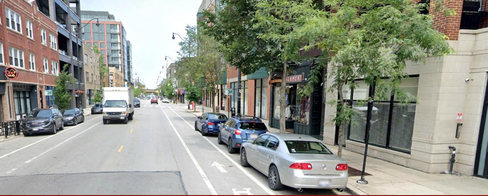
2463 N Lincoln Ave., Chicago, Illinois