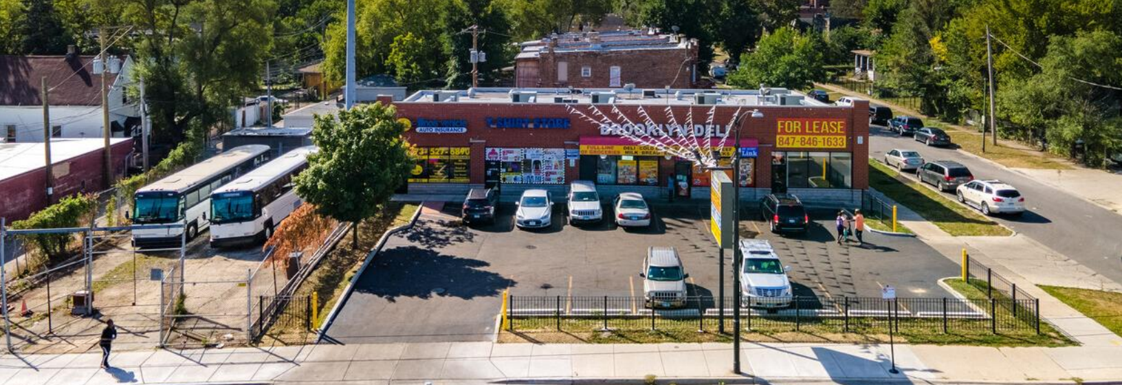
5425-33 W Chicago Ave., Chicago