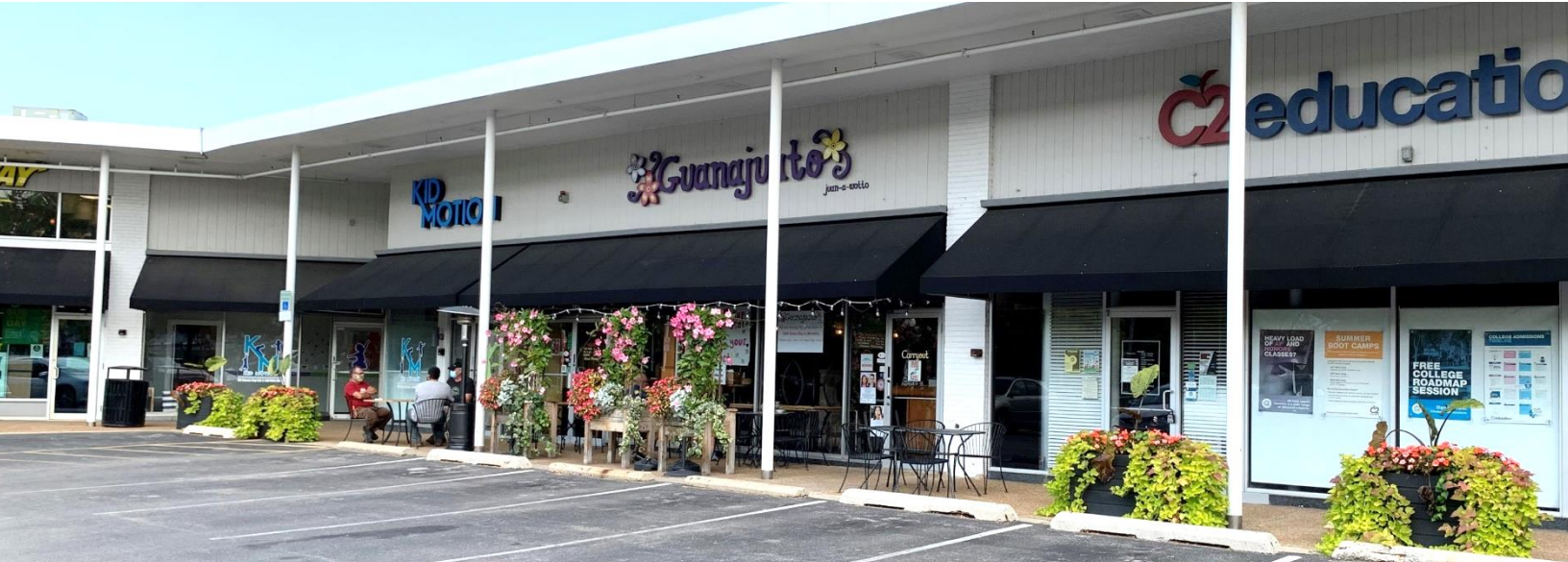
73 Green Bay Rd., Glencoe, Illinois