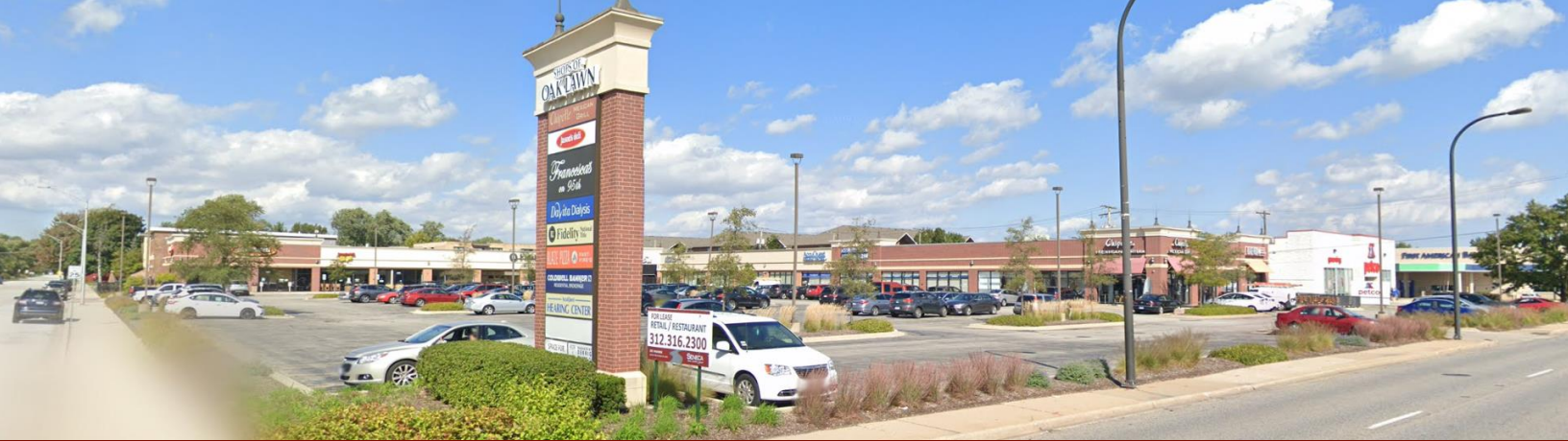
6232 W. 95th Street, Oak Lawn, Illinois